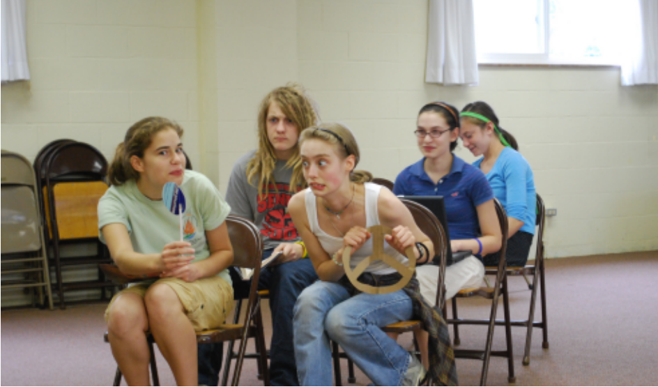
the Youth Group performs a hilarious opening skit demonstrating the need for support

The Youth Group's Fundraiser for National Youth Conference 2010 was a tremendous success! There was a fantastic turn-out of at least 30 people and the Youth Group would like to express its gratitude for all who attended. After a fabulous lunch of vegetarian spaghetti with garlic rolls & an assortment of fresh-baked desserts, the task auction began. Joyously, over $300 was collected towards the food and over $700 was raised from auctioning tasks. Auctioned tasks included weed-pulling, childcare, basement cleaning and many, many more. Laughs were shared by all as friends attempted to win help with their most treasured (despised?) tasks. One of the most surprising "hot tickets" was, believe it or not, leaf-raking --two folks with large yards went head-to-head in a bidding contest that drove the price to rather helpful heights for the youth! Truly, a great time, for a great cause, was had by all.