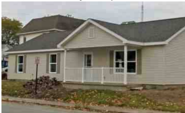
Most recent build: House 52 500 NW 2nd St